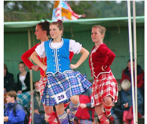
"Scotland were the red hot favourites in the new Highland dancing champions League"

I love watching sport on TV any sport that is, with the exception of Fishing, which is a waste of a good sit down by a river bank and Rugby League, because I don't see the point in a contact sport where you get a free kick for being tackled too many times! I get excited when Britain does well at any sport, (see photo!) especially the Olympics and happen to think that Sky Sports is one of best inventions of the 20th Century. However all the sports have their own clichés associated with them and the commentators for each sport abide by their own set of unwritten rules which can be very annoying to the dedicated viewer like me.