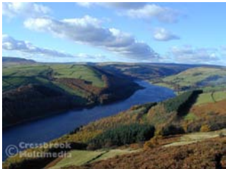
Ladybower from Whinstone Lee

"With the pressure of life and the financial climate pressing down on us sapping our strength and suffocating us we find it evermore difficult to unwind from the stresses of the day. It is easy to just get on that treadmill and do the same things day in, day out. So why not take the time out to think about ways to unwind and relax".