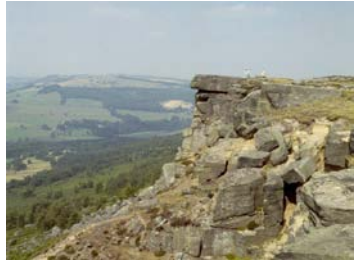
Cubar Edge, Derbyshire